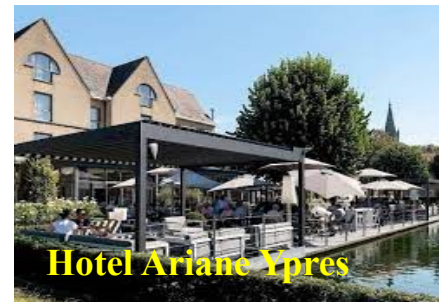
Hotel Ariane Ypres