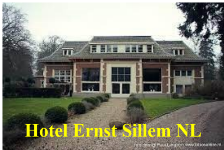
Hotel Ernst Sillem NL